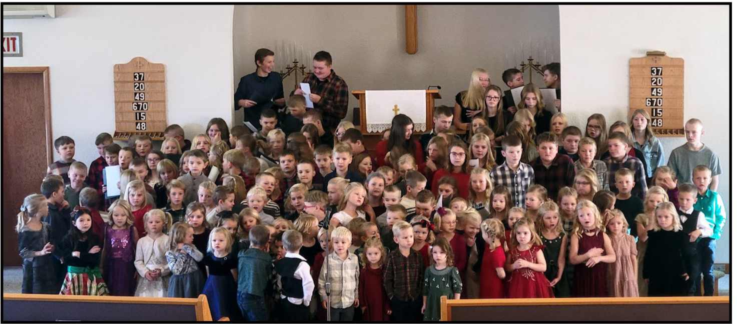
The Sunday School Program was held Sunday Morning, December 18, Dinner was served following the event. 142 Sunday School students participated.