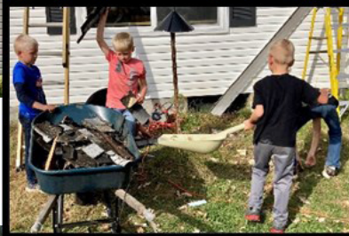
Young boys helped clean up. Great job Volunteers!