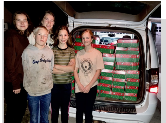
Boxes loaded in Van and delivered

All boxes had age-appropriate shirt and shorts or dress with matching socks. Other items included school supplies (writing paper, pencils, pens, crayons, rulers, scissors, markers etc.) health supplies such as comb, toothbrushes, etc. and fun things like puzzles, games, balls, toy cars, dolls, color books, flash lights, tape measure, etc. Gloves and stocking hats labeled for cooler climate.