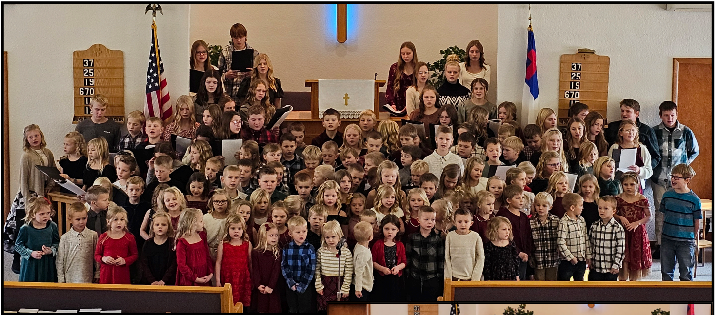
The Sunday School Program was held Sunday Morning, December 17, Over 130 students participated as well as their teachers & Sunday School Superintendent.