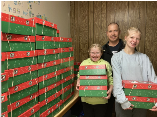
Banding and moving 200 boxes

All boxes had age-appropriate shirt and shorts or dress with matching socks. Other items included school supplies (writing paper, pencils, pens, crayons, rulers, scissors, markers etc.) health supplies such as comb, toothbrushes, etc. and fun things like puzzles, games, balls, toy cars, dolls, color books, flash lights, tape measure, etc. Gloves and stocking hats labeled for cooler climate.