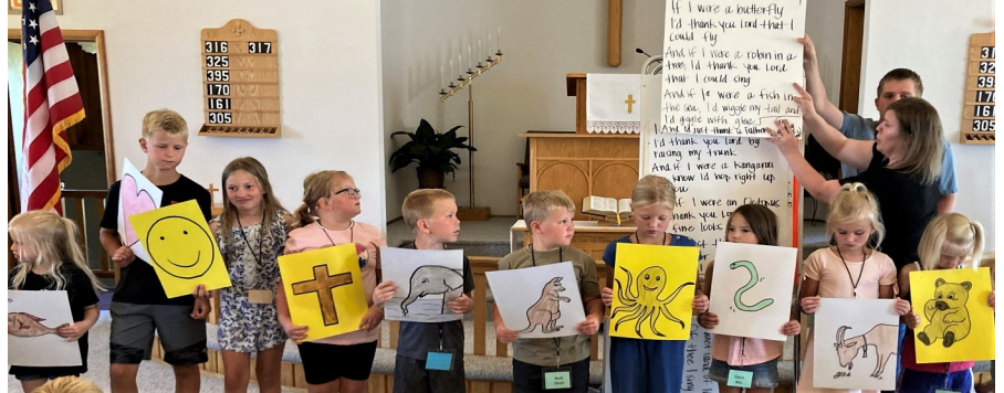
A program was held for the parent's, grandparents and friends on Friday evening July 22 & lunch followed.