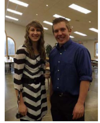
The picture above was taken at the fundraiser dinner that they held at Spruce Grove Church.

Please keep these two and all of the others they are traveling with in your prayers.