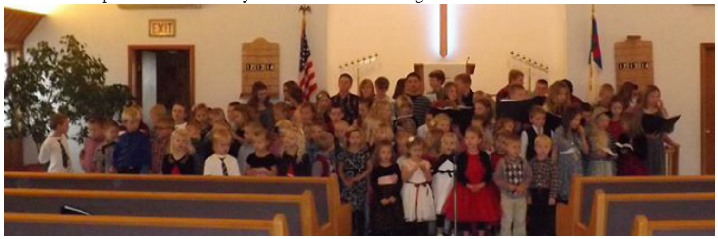
The Youth of the Church hosted a lunch for the Elders of the Church. They are pictured below singing hymns & carols for the elders as well.

The Spruce Grove Sunday School Christmas Program was held on December 14th.