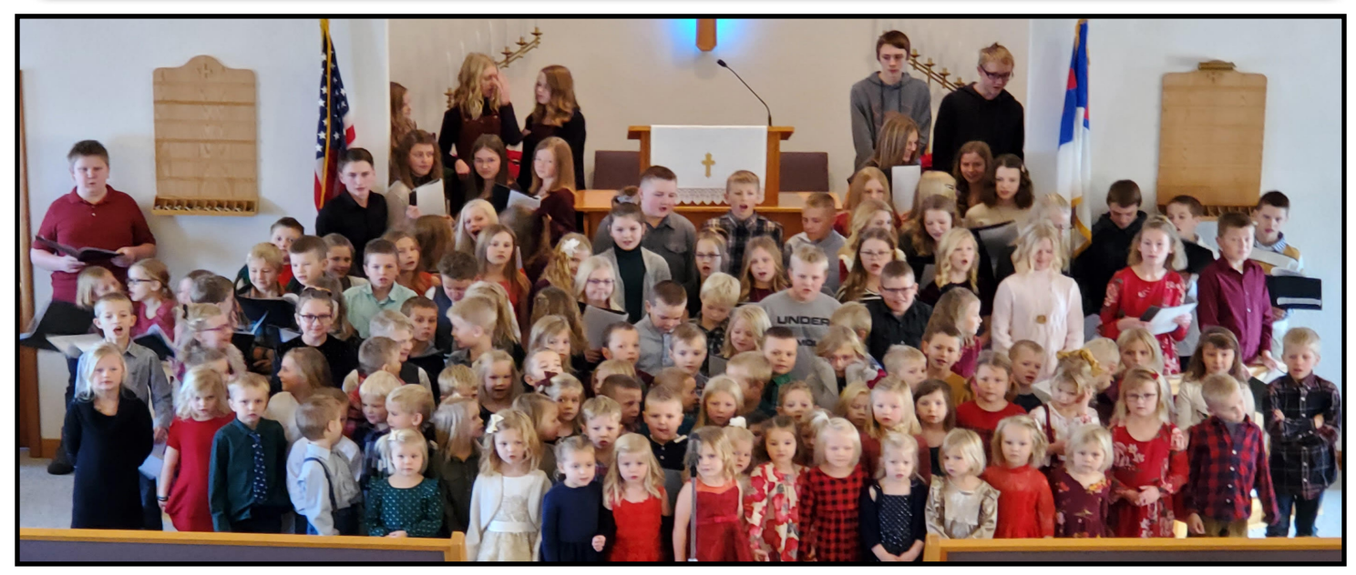
The Spruce Grove Sunday School Christmas Program was held on December 20th, 2020. Pictured below are the children in Pre-school through 9th grade singing the closing songs. There are over 125 children in Sunday School this year.