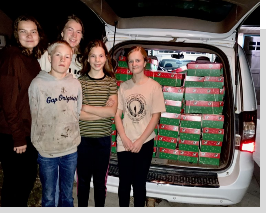
Boxes loaded In Van and delivered

All boxes had age-appropriate shirt and shorts or dress with matching socks. Other items included school supplies (writing paper, pencils, pens, crayons, rulers, scissors, markers etc.) health supplies such as comb, toothbrushes, etc. and fun things like puzzles, games. balls, toy cars, dolls, color books, flash lights, tape measure,etc. Gloves and stocking hats labeled for cooler climate.