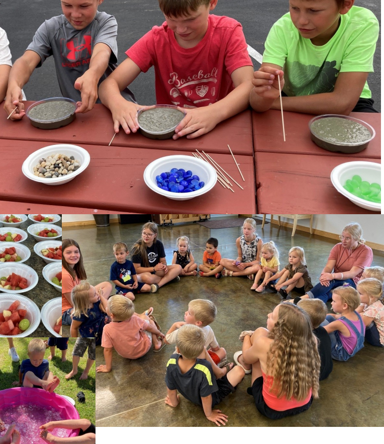
Healthy snacks were provided during a break. They also had time for brief outdoor activities and time for singing in the beginning and end of each day's activities!